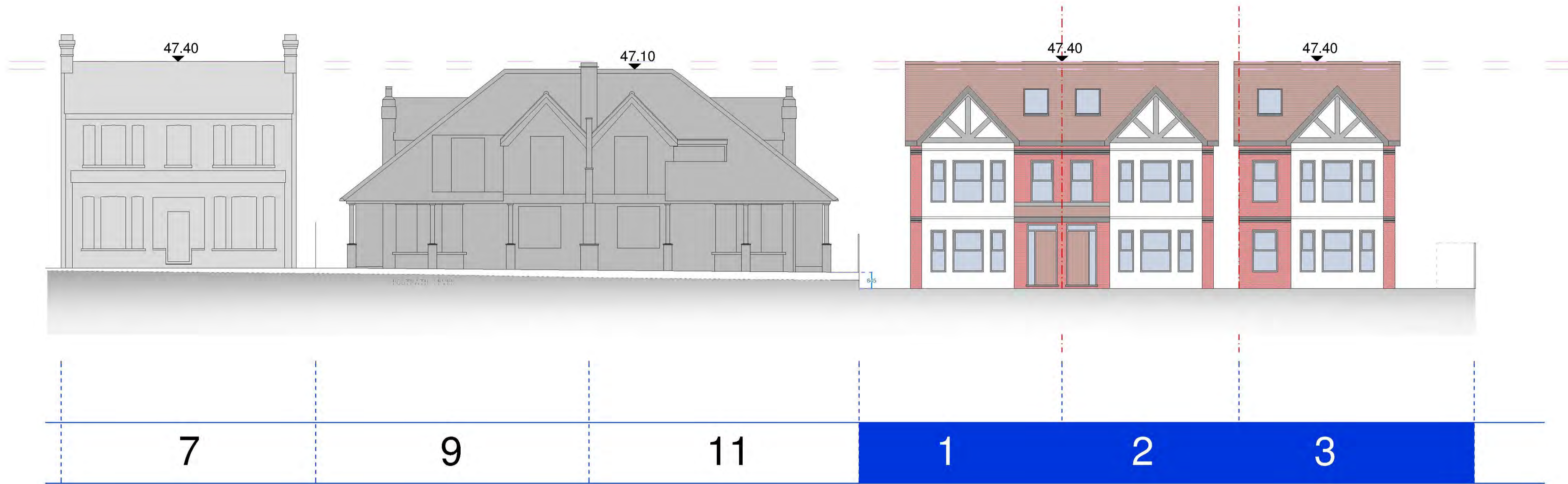
08 Proposed Streetscene GA

BUILDER INFORMATION: DO NOT BUILD FROM ANY DRAWING PACKAGES THAT DO NOT SAY: BUILDING CONTROL APPROVED OR IN CONSTRUCTION PACKAGES. IT IS THE RESPONSIBILITY OF THE BUILDER TO CONTACT THE ARCHITECT TO REQUEST CONFIRMATION OF THE RIGHT DRAWING PACKAGE TO USE ON SITE. PLEASE BE ADVISED THAT ALL DRAWING PACKAGES WILL ALSO HAVE STRUCTURAL ENGINEERING WORKS ATTACHED. DO NOT BUILD WITHOUT ALL PAPERWORK. THE CONTRACTOR IS TO ALLOW WITHIN THEIR PRICE FOR ALL ITEMS NOT LISTED BUT THAT WILL BE REQUIRED TO COMPLETE THE WORK IN ACCORDANCE WITH ALL CURRENT LEGISLATION. DRAWING NOTES: ALL ITEMS, NOTES, DIMENSIONS AND GENERAL DESIGN CONTAINED IN THIS DRAWING ARE FOR GUIDANCE PURPOSES ONLY. NOMINATED BUILDER AND PERSON RESPONSIBLE FOR THE PROJECT SHOULD MAKE A THOROUGH CHECK PRIOR TO COMMENCEMENT OF WORKS AGAINST SITE, DRAINAGE SERVICE DRAWINGS, CURRENT BUILDING REGULATIONS, BRITISH STANDARDS AND CODES OF PRACTICE. FAILURE TO DO SO WILL BE AT THE LIABILITY OF THE BUILDER/CONTRACTOR AND NOT THE ARCHITECT. COPYRIGHT: THESE DRAWINGS REMAIN THE COPYRIGHT OF BERESFORD & BARNES LTD AND MUST NOT BE USED IN ANY WAY PRIOR WRITTEN CONSENT. IMPORTANT NOTE: NO SIGNED AGREEMENT IS IN PLACE TO ALLOW THE COPYING OF THE WORKS ATTACHED.